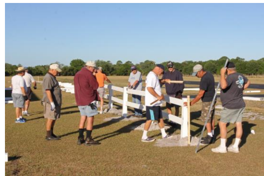
Hard working crew putting up new fence