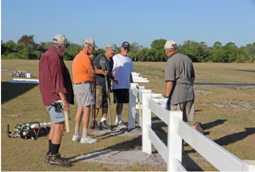
Brief discussion about next step on fence