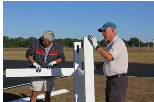
Putting pieces together for flight station