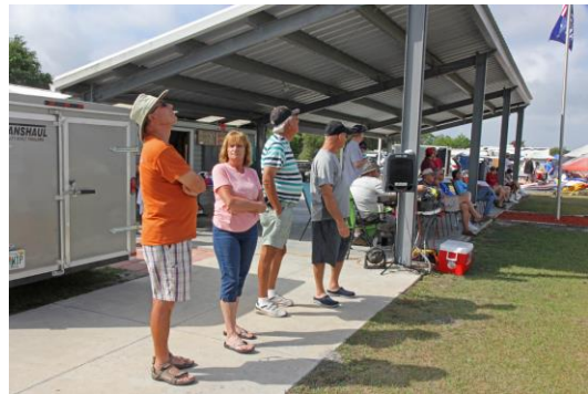
Spectators at the IMAC show