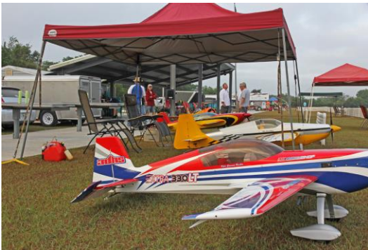
Planes lined up at the IMAC event