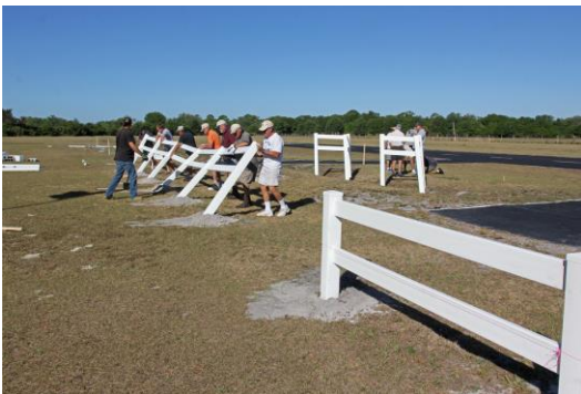
Assembly line at work on new fence