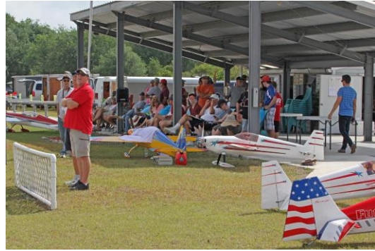
Great crowd on land at IMAC show