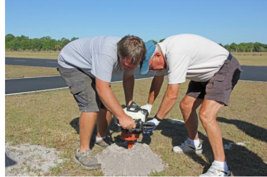
Toughest job on fence is holes for posts