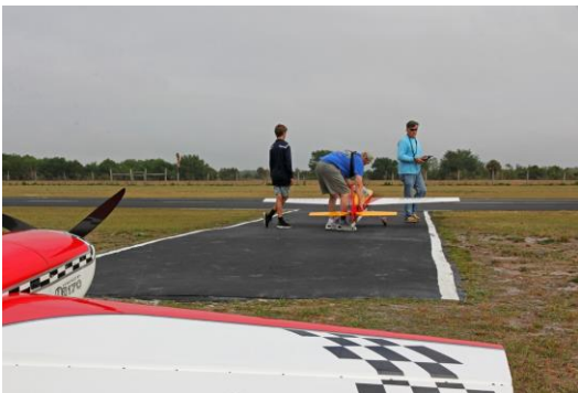
Planes on flight line at the IMAC event