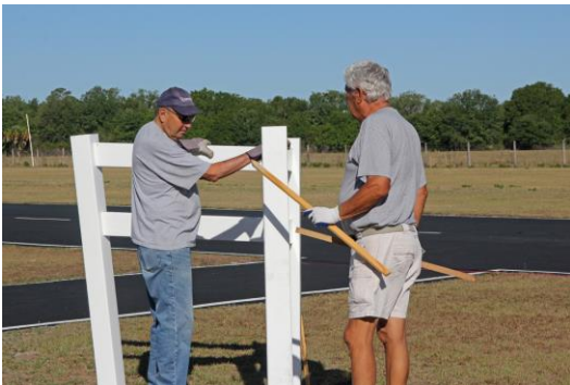
Installation of new flight station