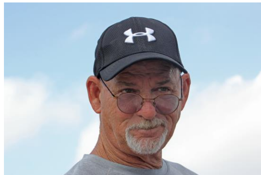
Our PRESIDENT in deep meditation?